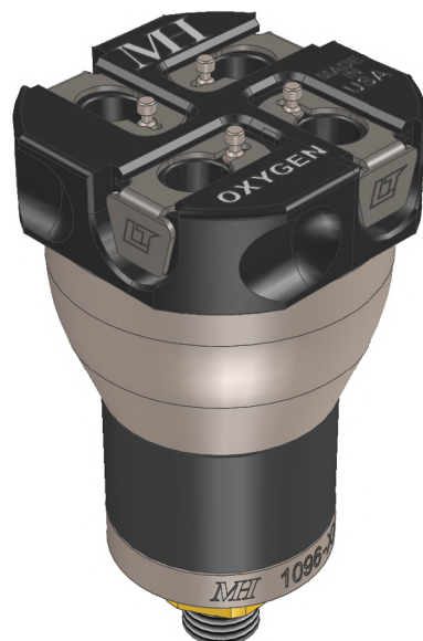
00REG-1096-14 (4x Axial CPC Outlets)