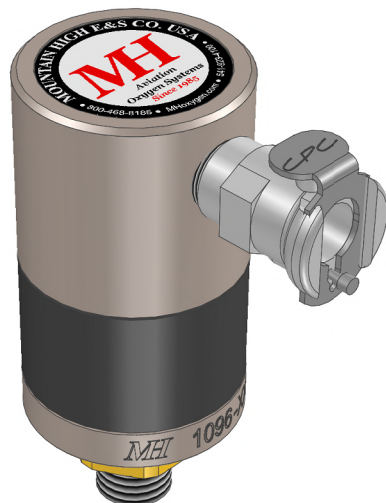
00REG-1096-10 (Radial CPC Outlet)